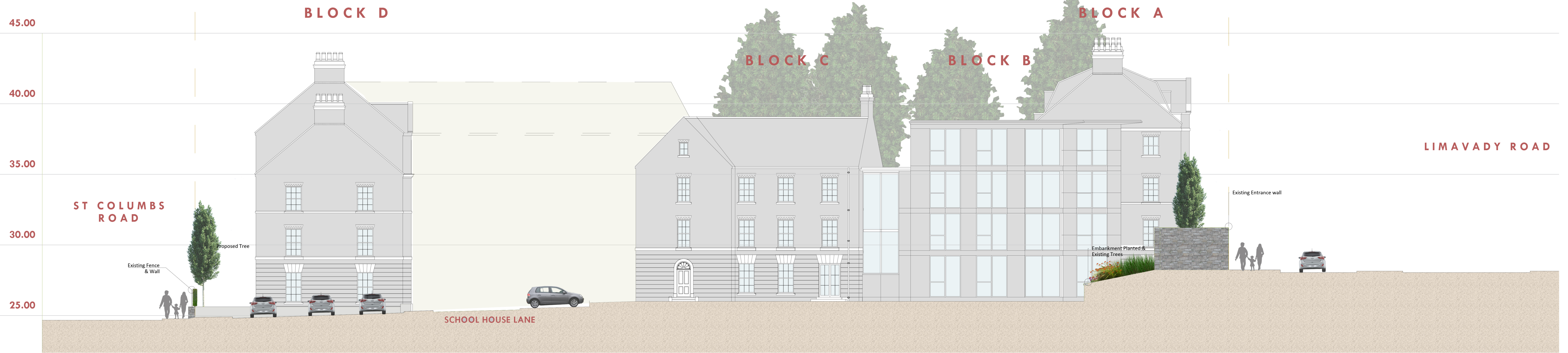
Landscape Section Section A-A