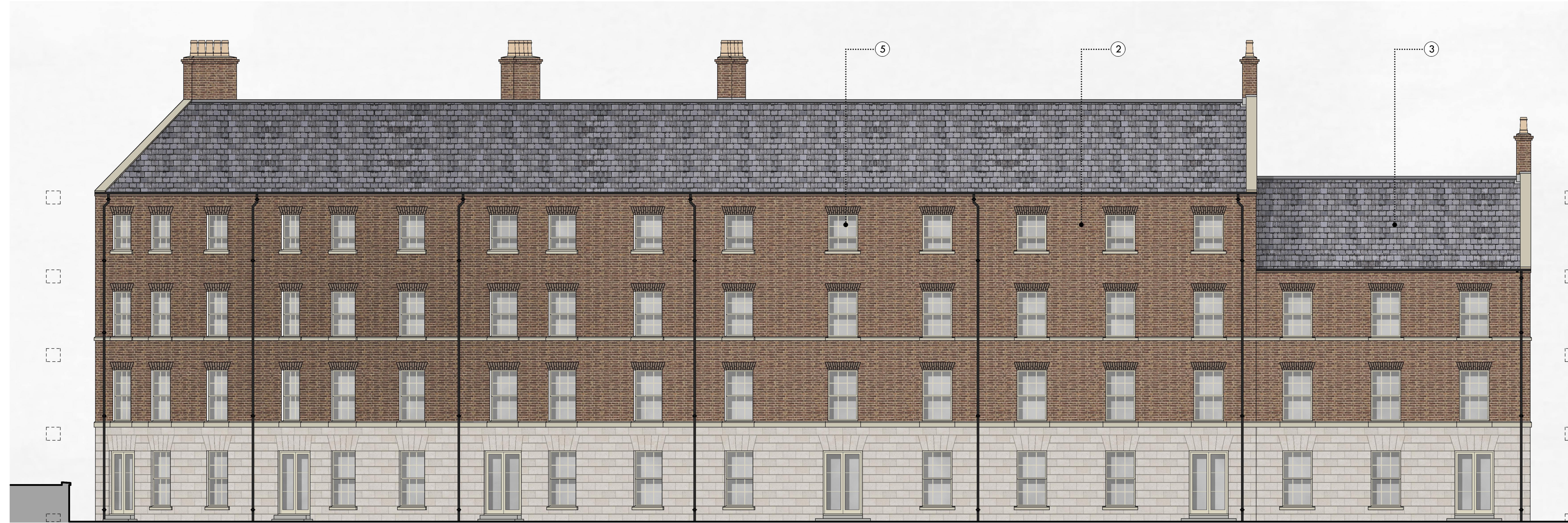
5 Elevation To St Columbs Road