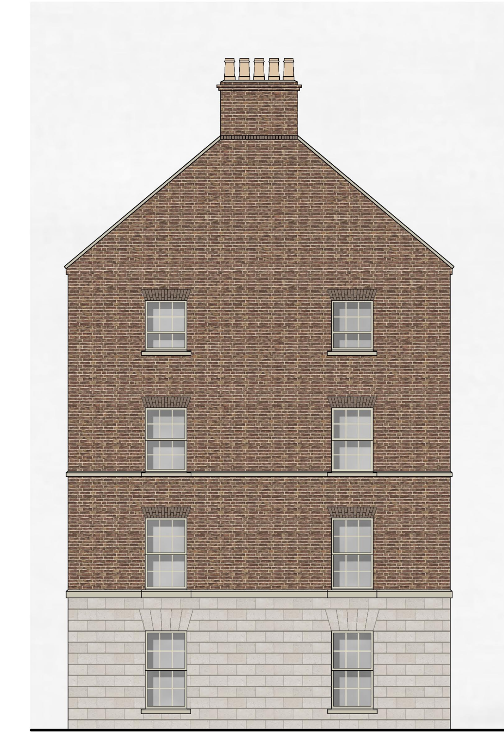
7 Side Elevation