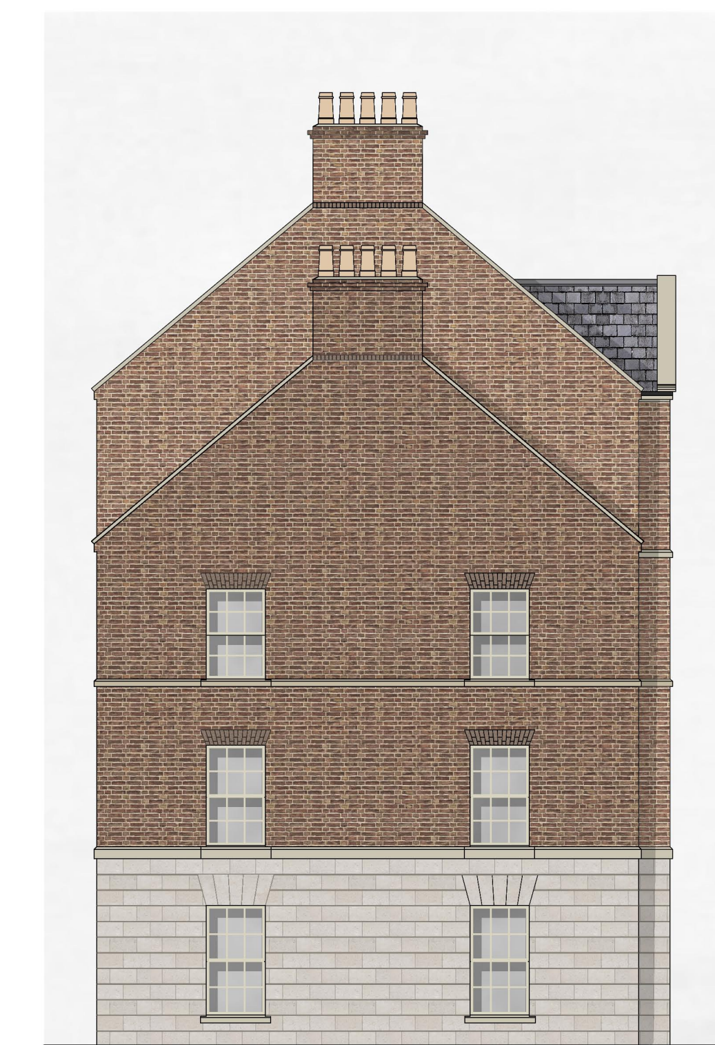
8 Side Elevation