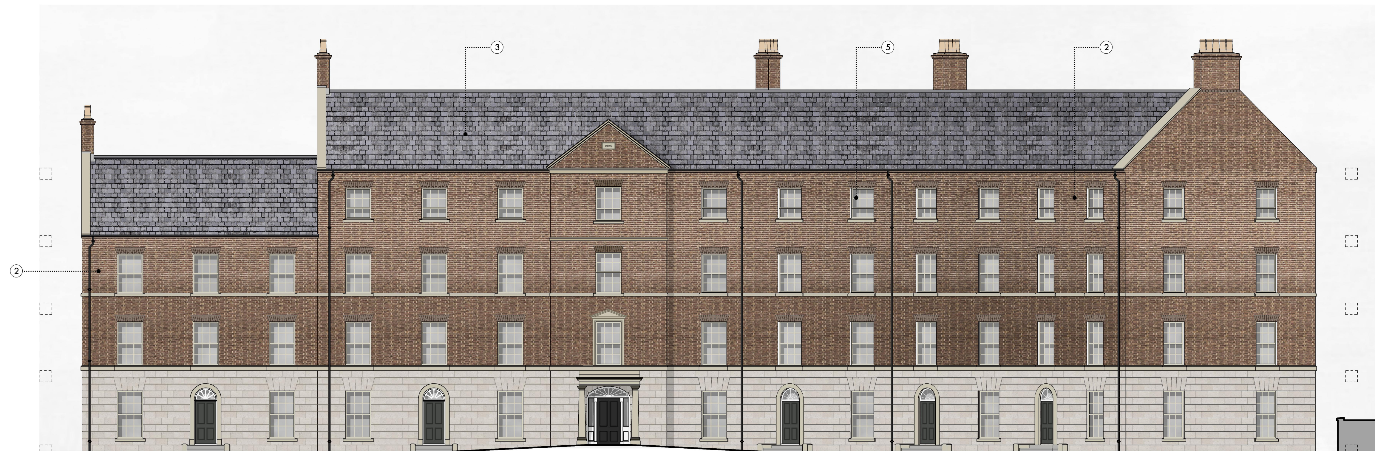
6 Front Elevation To Courtyard Parking