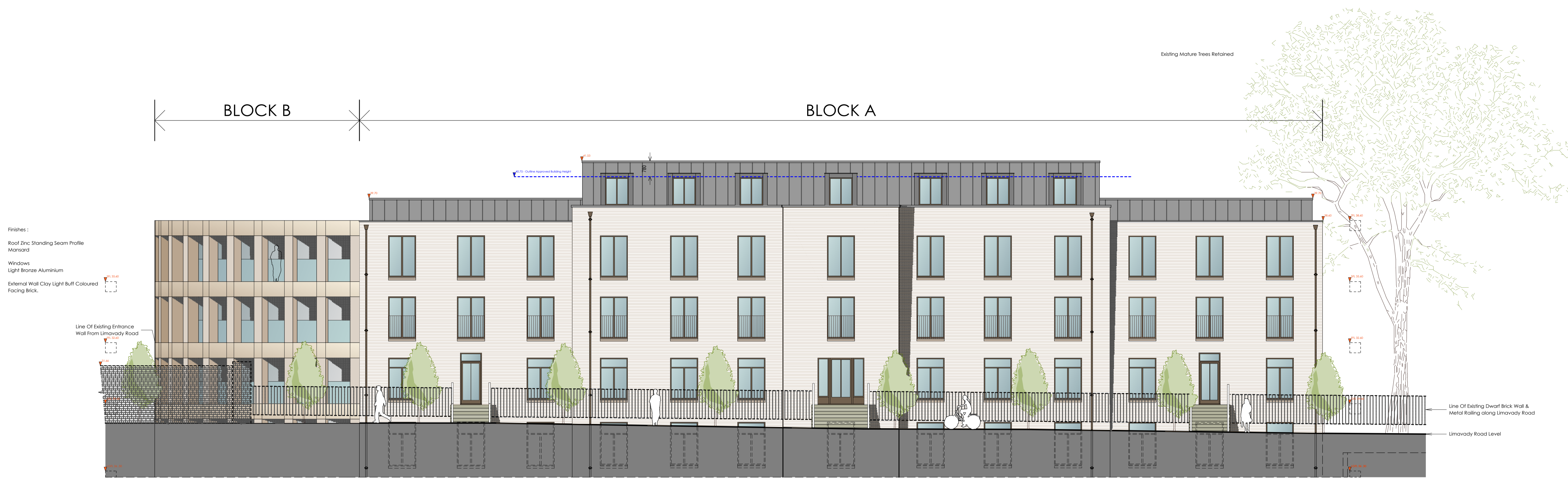
South East Elevation To Limavady Road