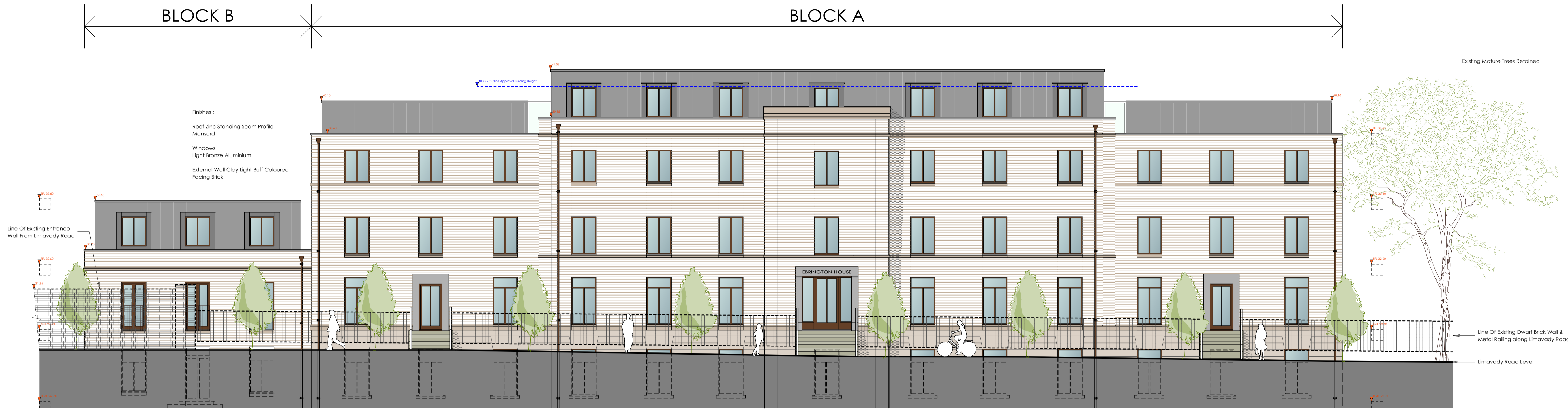
South East Elevation To Limavady Road